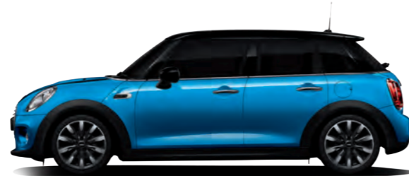
MINI 5-DOOR HATCH.