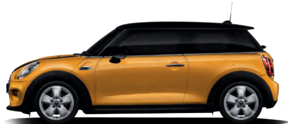
MINI 3-DOOR HATCH.