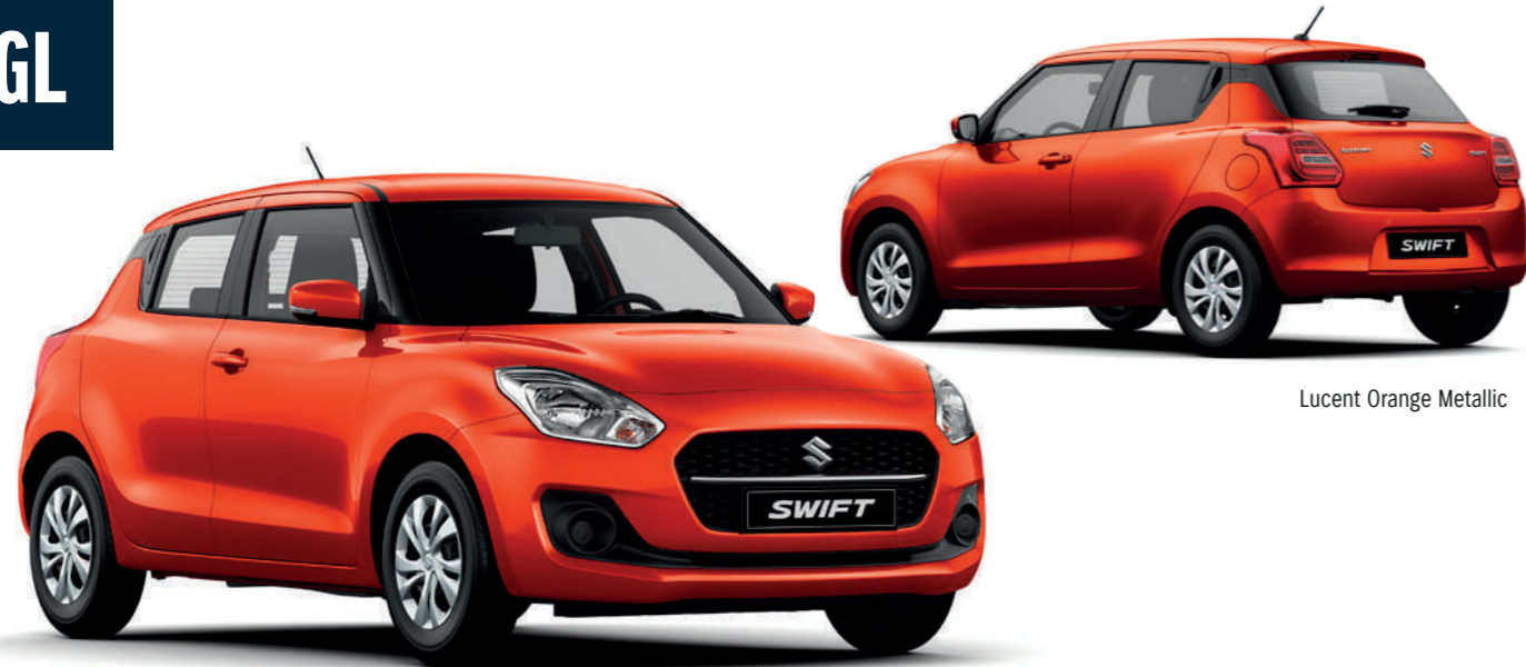
Lucent Orange Metallic