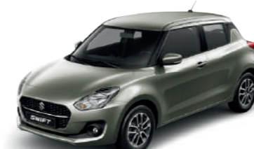
Magma Gray Metallic