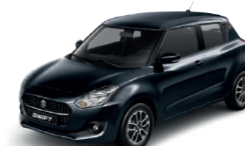
Midnight Black Pearl