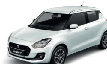
Arctic White Pearl