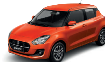
Lucent Orange Metallic