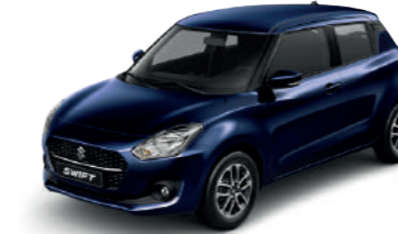
Midnight Blue Pearl Metallic