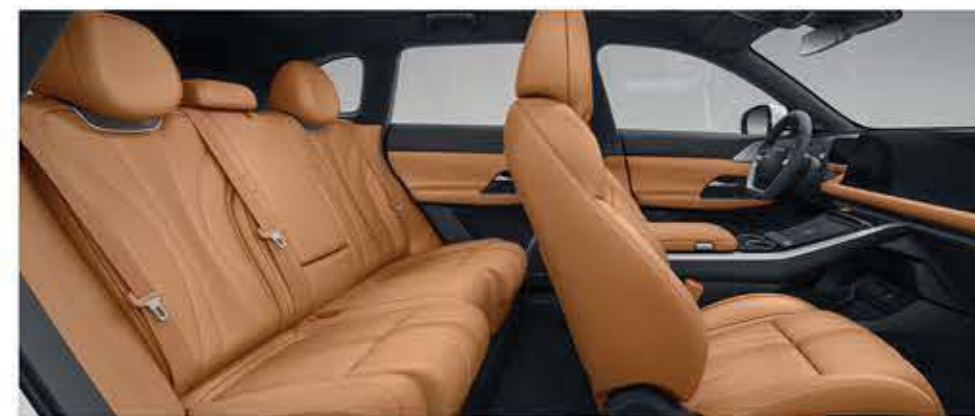
SADDLE TAN NAPPA LEATHER