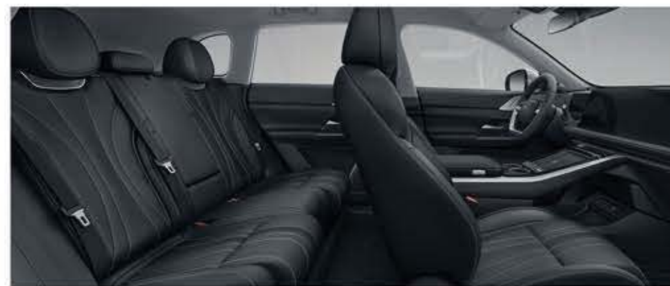
BLACK NAPPA LEATHER